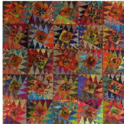
Wild Women Don't Get the Blues

Have I ever had more fun making a quilt than I did making this one? I hope you will enjoy it too. The patchwork is pretty straightforward, but amazing and wonderful things happen with color and secondary design. (never foundation-pieced? Perfect!)