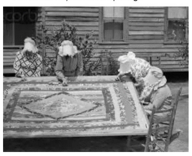
"Before Prozac, there was quilting".