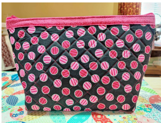
Quilted Zipper Bag (Cindy McCord)