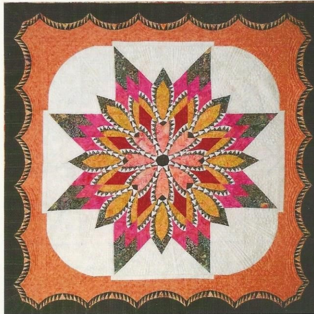
Desert Rose Raffle Quilt