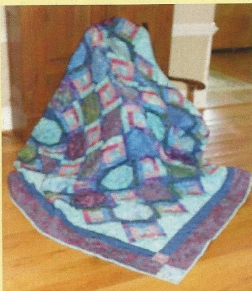
Queen Size Donation Quilt

March 8-9, 2019 Friday & Saturday 9:30 a.m.-3:30 p.m. Admission $5.00