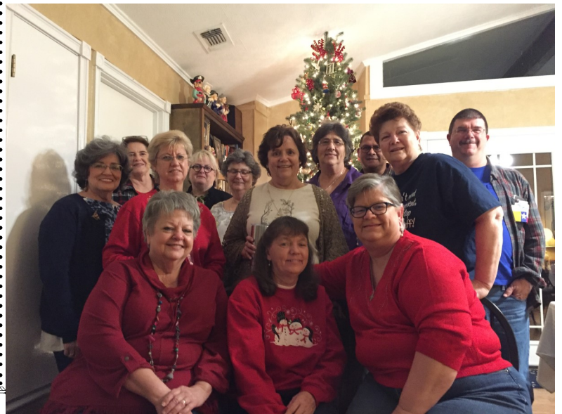
AHQG BOARD MEMBERS AND CHAIRS CURRENT/FUTURE

Have yourself all fixed up and ready to go at the next meeting!