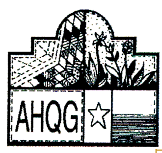
ESTABLISHED 1995 Inside this Issue: