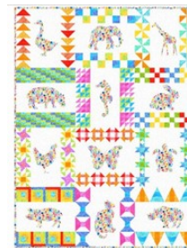
Quilt size 72 1/2" x 96 1/2"